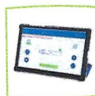
Android tablet with tablet case