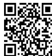
VLEIF - Facebook