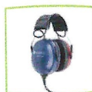
AC headphone easyTone